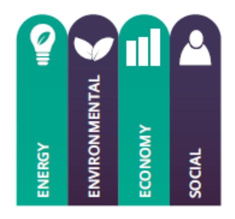
Figure 1.1: Four (4) Pillars of National Green Technology Policy (NGTP)

National Green Technology Policy 2009 By KeTTHA